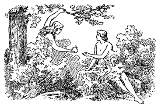
Yawan nani ba Setan bila baikra ba walaia apia sa.