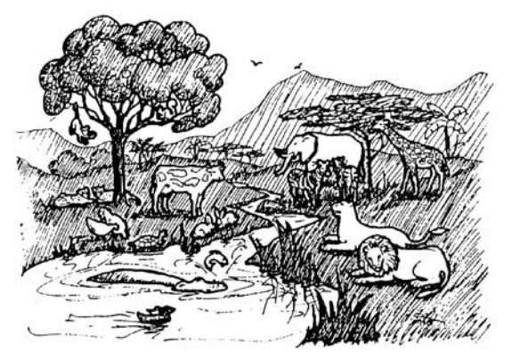
Mawan bila tani pura taya © 2004 Rose Goodman ulban. Pura taya ulbanka, Edwin B. Wallace. Merly Esenwein, Purara, wahya: 10, 12, 14, 16, 27, 29, 39, 41, 42, 44, 46, 47 bara 48 nani ra sa.